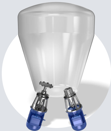
Emulsion reactor / Homogenizer