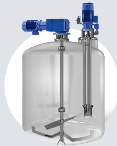
Preparation and storage tank